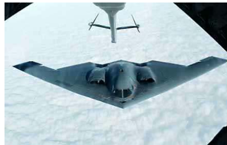
Stealth bomber being refueled in flight

Every purchase you make with a credit card, every magazine subscription you buy and medical prescription you fill, every Web site you visit and e-mail you send or receive, every academic grade you receive, every bank deposit you make, every trip you book and every event you attend — all these transactions and communications will go into what the Defense Department describes as "a virtual, centralized grand database."