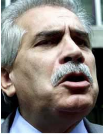
Italian scientist Antinori braas of new cloned human

"You are in danger if you decide to become a Muslim. It is not going to save you anyway because they believe traditional Islam is hostile to their goals."