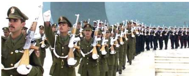
Iraqi soldiers parade in Baghdad

They said the U.S. destroyer will remain off the Israeli coast to protect