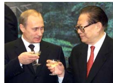
Putin and China's Jiang Zemin toast new bilateral agreements

The remarks were a complete contradiction of the official Iraqi position. Baghdad has insisted repeatedly that it no longer has chemical, biological or nuclear weapons nor medium-range missiles.