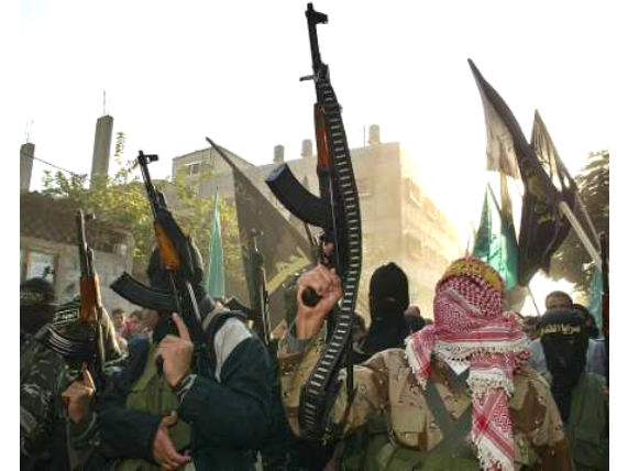
Palestinians demonstrating in Gaza

The US has approached Syria "at the highest levels" to close down the headquarters of Islamic Jihad in Damascus, US officials said Monday. Since Islamic Jihad claimed responsibility for Friday night's ambush in Hebron that left 12 security personnel dead, the Prime Minister's