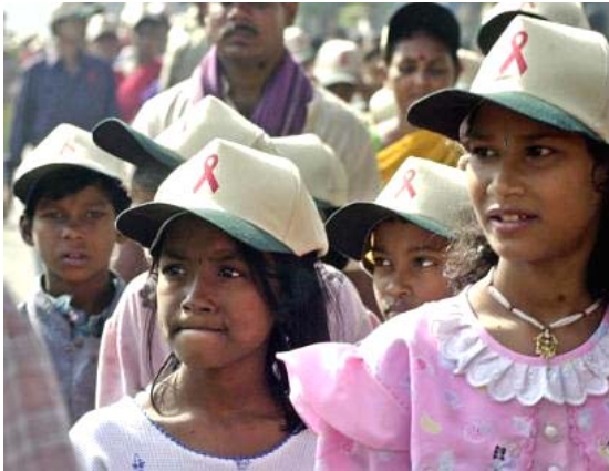
Children of Calcutta sex workers parade during World AIDS day demonstrations

Human Fertilization and Embryology Authority (HFEA) covers a technique in which an unfertilized egg is stimulated in the laboratory to develop into an early embryo. The procedure is called parthenogenesis, which literally means 'virgin birth' and results in cloned embryos that develop without the need for sperm to fertilize an egg.