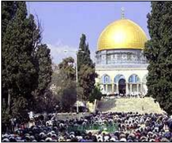
Jerusalem is holy to both Muslims and Jews