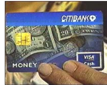
Smart cards go wireless