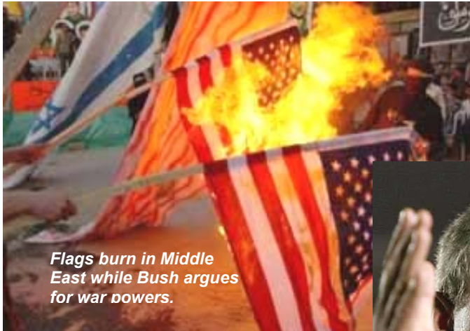
Flags burn in Middle East while Bush argues for war powers.