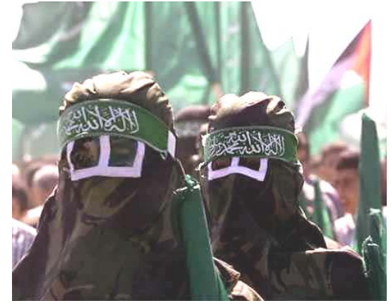
Hamas march in refugee camp.

Hamas, which has claimed responsibility for many deadly suicide bomb attacks, has vowed repeatedly to continue its suicide attacks against Israelis.