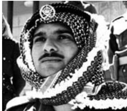
Prince Hassan dressed for war in 1970

HRH Co-Chairs the Bureau with Sadruddin Aga Khan