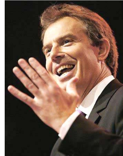
Blair speaks in Blackpool to Labor Party

year's end we must have revived final status negotiations and they must have explicitly as their aims: an Israeli state free from terror, recognized by the Arab world and a viable Palestinian state based on the boundaries of 1967."