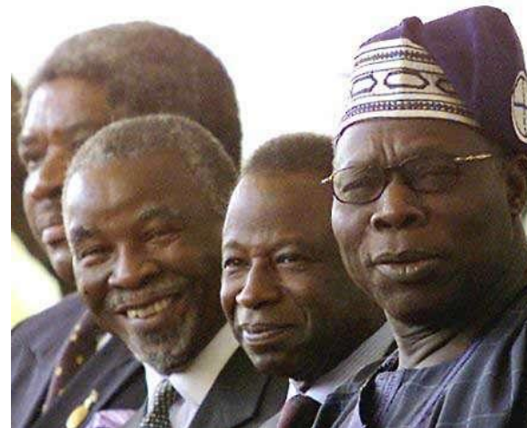
African leaders at summit to kick-off the AU

One of the most senior figures in Europe's debate on its future has added his voice to calls for a powerful president to give strategic direction to the European Union.