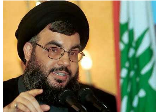
Hezbollah leader Nazrallah denies ties to al Qaeda

the area closed to everyone but Muslims during Sharon's term in office. But now there is a growing move to reopen the Temple Mount to people of other faiths.