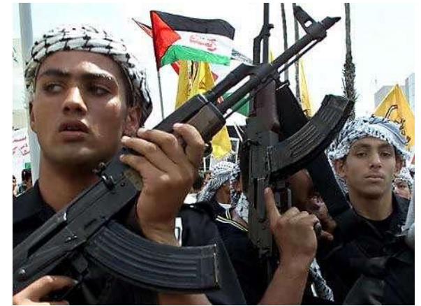
Arafat's Fatah gunmen at public rally.

Leading experts on Saudi Arabia warned that rising anti-U.S. sentiment in the kingdom could force Abdullah to drop his proposal for an Arab-Israeli peace. The experts said Saudi Arabia is being gripped by an effective anti-U.S. boycott and anti-U.S. demonstrations.