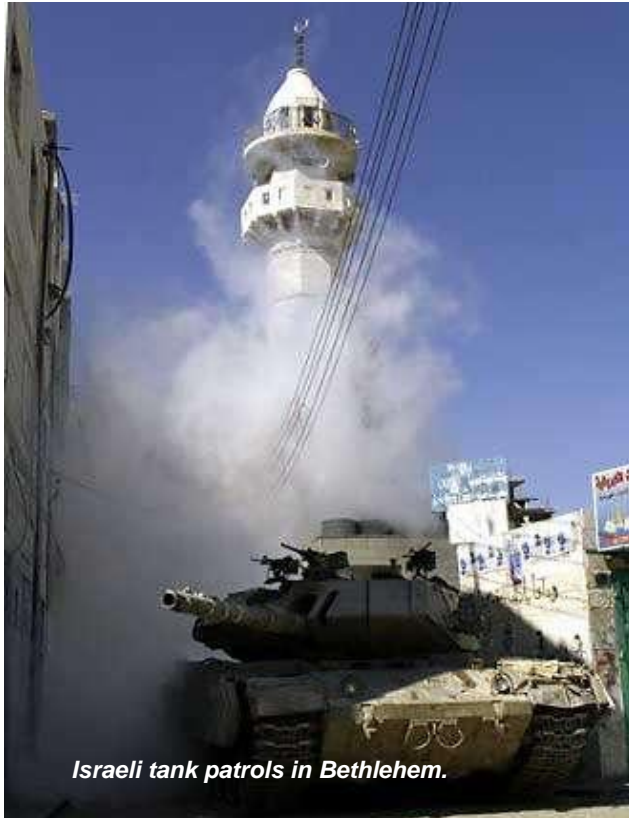
Israeli tank patrols in Bethlehem.

The sources said Mubarak also turned down Bush's appeal for Egypt's cooperation in a military campaign to topple Iraqi President Saddam Hussein.