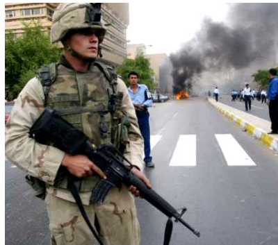
Despite terror, great progress has been made in rebuilding Iraq.

necessity of stepping up international efforts to overcome the crisis."