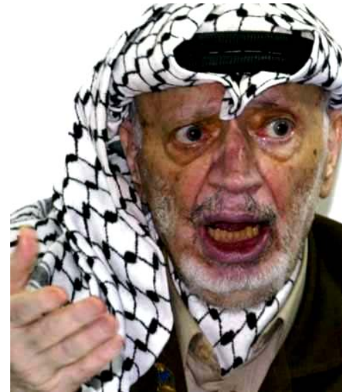
Arafat's health has gone downhill

The army said the map was intended to illustrate the extent of the "Terror Network in the Damascus Region." It came on the same day that Prime Minister Ariel Sharon said Israel would attack its enemies "any place, and in any way."