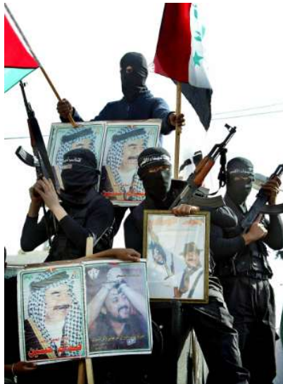
Al Aqsa protests Hussein capture

'Since the 1970s, Syria has pursued what is now one of the most advanced Arab state chemical weapons capabilities,' Undersecretary of State John Bolton said on Oct. 30. 'It has a