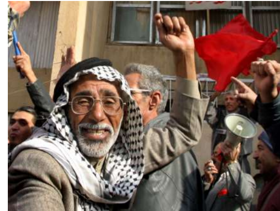
Iraqi man celebrates news of Saddam's end

Sharon's office said Thursday that it is committed to the road map, but has 14 reservations. These include a demand that the Palestinians first dismantle militant groups and that the