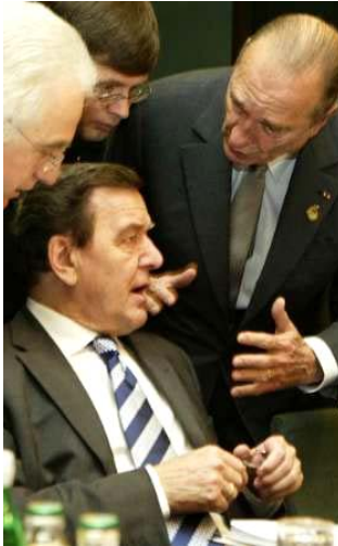
France's Chirac and Germany's Schroeder argue at EU constitution summit.

A spokesman for the Foreign Ministry expects Commissioner Verheugen to visit Israel in 2004, and the ministry has created a special task-force to coordinate between the government offices and prepare for the EU delegation's visit.