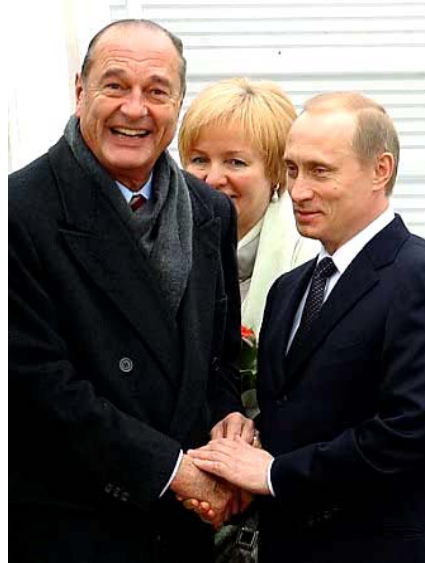
Putin agrees with Chirac on Iraq

The draft Constitution would establish a United States of Europe. The main differences between this Constitution and that of the United States of America are that the new Europe would take more power to the centre, leave less independence to the individual states, have fewer and weaker constitutional safeguards and would be undemocratic.