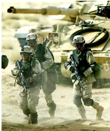
Bravo Company trains in Kuwait

governments that are allied with the United States.