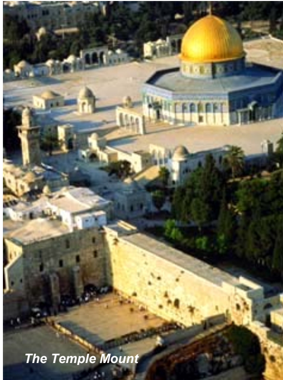
The Temple Mount

[The] final document ... expresses the need for dedicated efforts to "examine