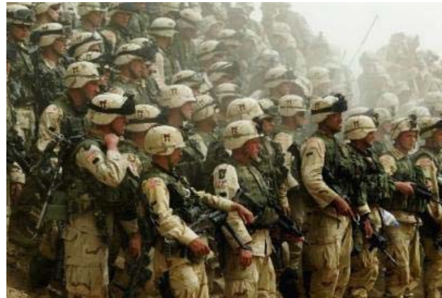
US soldiers gather in Kuwait as war begins

"We see Russia as one of the privileged neighbours," Italian Foreign Affairs Minister Franco Frattini said last week. "The EU-Russia relationship does not only have to be on economy but spread over a 360 degree level."