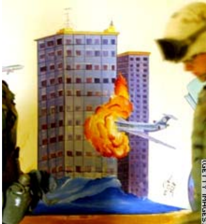
911 mural found in Iraqi military HQ

Mr Sabri said that he would attend a meeting of Arab League Foreign Ministers today in Cairo, where he would call on member states to take a "true stand". He said: "The Arab people took that stand. Now we hope the regimes will take this stance, too."