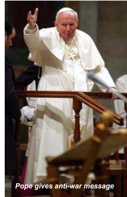
Pope gives anti-war message

against the United States and allied forces that participate in the war against Iraq. The seminary said all Muslims are required by their religion to join the jihad