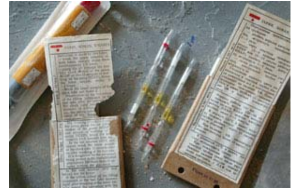
Sarin antidote kit found by British soldiers in Iraq

The explosion just hours earlier on the Tel Aviv beachfront raised questions about the revamped Palestinian