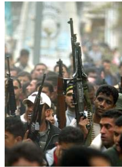
Palestinian gunmen march in Jenin

He could have said more. According to DEBKAFfile's Washington sources, the defense secretary was also informed