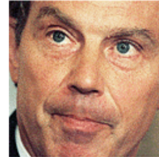
Tony Blair as EU Prez?

The call was the clearest sign yet that Mr. Blair could pitch to become the