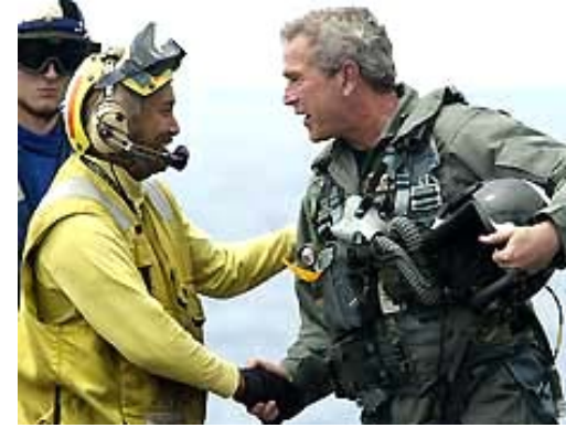
Bush is first sitting President to land on US carrier at sea.

Europe and the United States should work as "one polar power" to tackle the world's problems rather than bickering as they did over Iraq, British Prime Minister Tony Blair said in an interview published