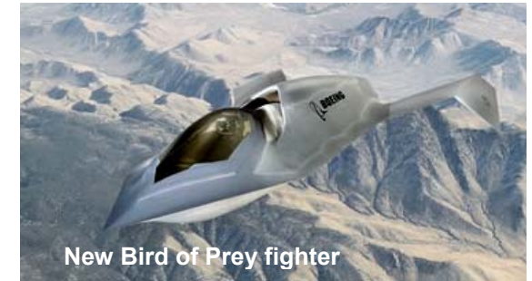
New Bird of Prey fighter

Another Nobel prize winner, geneticist Sydney Brenner, agrees that the new ability to examine our genes, marked by