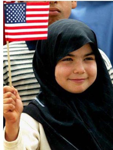
Iraqi girl welcomes American troops

Assad, who has expressed support for Saddam Hussein's regime in the face of coalition action, gave the interview to the pro-Syrian daily Al-Safir. His comments