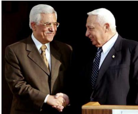
Palestinian Prime Minister Mahmoud Abbas (L) shakes hands with Israeli Prime Minister Ariel Sharon prior to talks on the international peace 'roadmap' after both sides took significant first steps in Jerusalem July 1, 2003. Israel's prime minister and his Palestinian counterpart met to discuss the way ahead for a U.S.-led peace plan after a partial Israeli pullout from the Gaza strip and a truce by Palestinian guerrillas.

When the U.S. administration described Israeli Prime Minister (Ariel Sharon) as a man of peace, it seems that the terrorism it wants to fight is martyrdom operations against Israeli