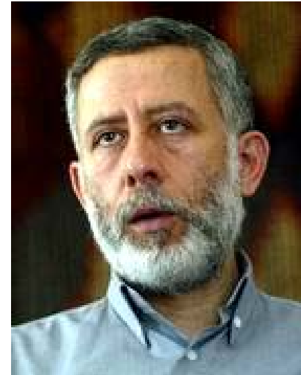
Leader of Islamic Jihad, Mohammed al-Hindi