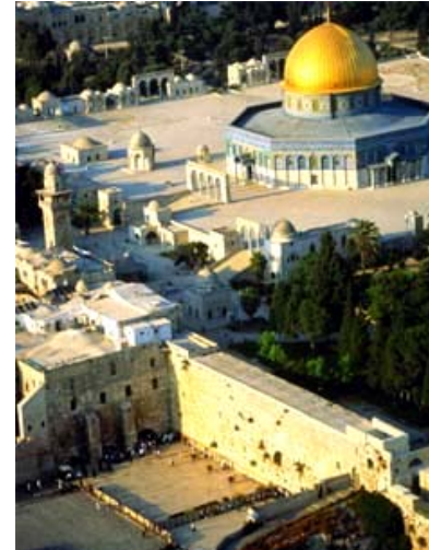
The Temple Mount in Jerusalem

plaza area, which the Waqf Muslim religious trust closed to non-Muslims after the riots following then-opposition leader Ariel Sharon's visit there in September 2000. Palestinians say the visit sparked the Al-Aqsa Intifada, named for the mosque on the mount.