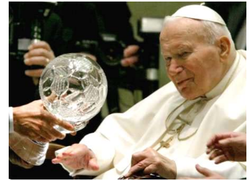
Pope receives gift of a crystal ball.

"War on Christianity" author David Limbaugh says the list of examples is long and is evidence of an undeclared cultural war on the religion.