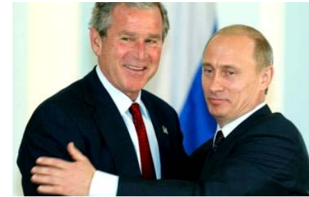
Bush and Putin have been on good terms in the past.

Russian Defense Minister Sergei Ivanov inaugurated the new set of Topol-M missiles at the Tatischevo missile base in the central Saratov