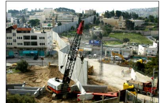
Israeli security fence under construction in Abu Dis