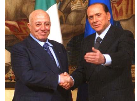
Italy's Berlusconi welcomes the PA's newest PM Ahmed Qureia who is to meet with the Pope.

Italy, which is one of the six founding member states of the EU as well as being one of the 'large' member states has been left out - but it is not alone in expressing its concern.