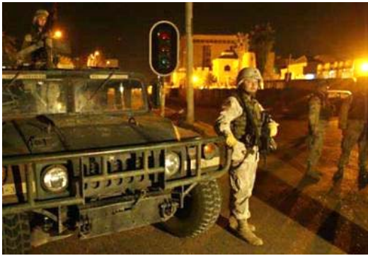
US Soldiers on guard at site of rocket attack in Baghdad preceding the signing of Iraq's interim constitution.