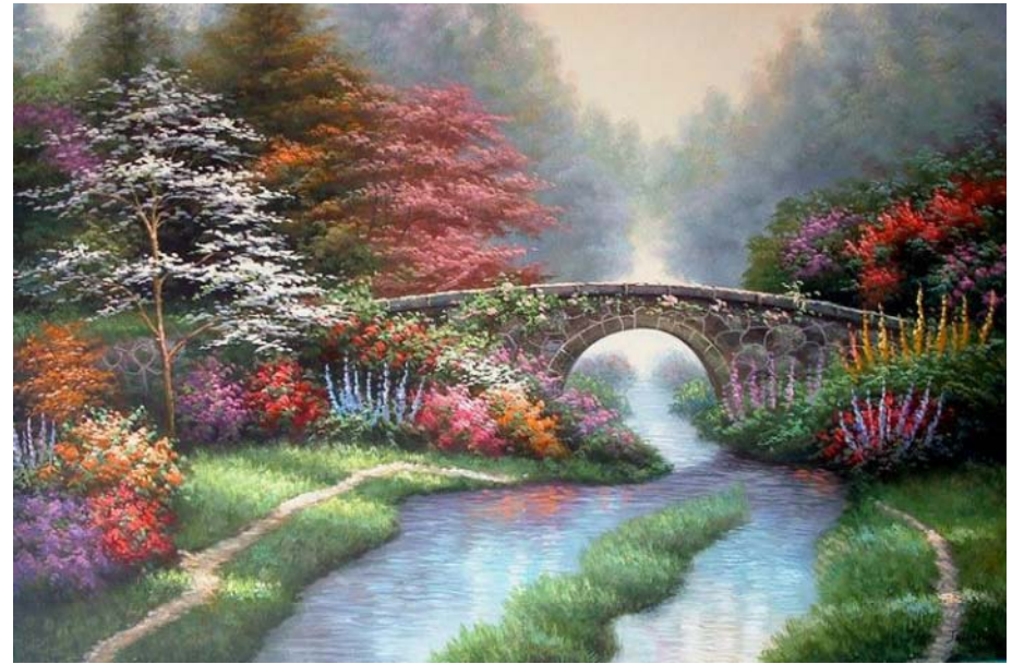
Let the field be joyful, and all that [is] therein: then shall all the trees of the wood rejoice Psa 96:12

The Pope is called the Vicar of Christ. Vicar is defined as "one serving as a substitute." Jesus said in Matthew 24:5, "For many will come in my name, saying, 'I am the Christ,' and will deceive many." The Catholic Church, its doctrine, its Pope and its politics certainly bear a watchful eye as the world marches toward the end-times.